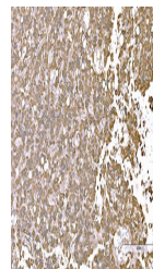
IHC analysis of SND1 using anti-SND1 antibody.