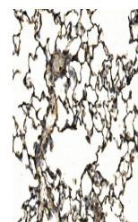
IHC analysis of CD11c/Itgax using anti-CD11c/Itgax antibody.