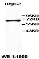
Western blot analysis of fetal spleen ly...