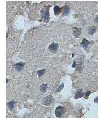
Immunohistochemical analysis of formalin...