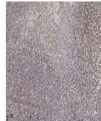
Immunohistochemical analysis of paraffin...