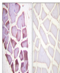
Immunohistochemistry analysis of paraffi...