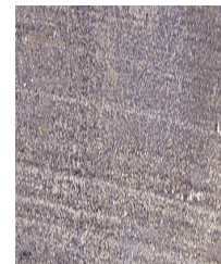
Immunohistochemical analysis of paraffin...