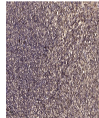
Immunohistochemical analysis of paraffin...