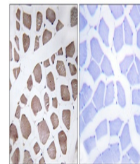
Immunohistochemistry analysis of paraffi...