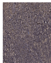
Immunohistochemical analysis of paraffin...