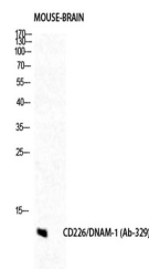
Western Blot analysis of mouse-brain cells...