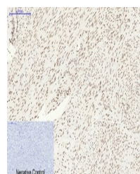
Immunohistochemical analysis of paraffin...