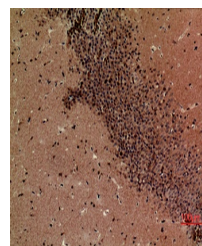
Immunohistochemical analysis of paraffin...