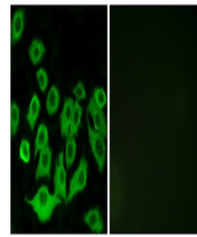
Immunofluorescence analysis of A549 cell...