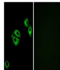
Immunofluorescence analysis of A549 cell...