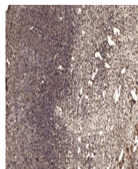
Immunohistochemical analysis of paraffin...