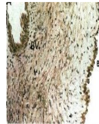
Immunohistochemical staining of PTHLH an...