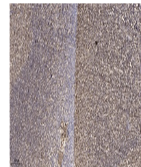
Immunohistochemical analysis of paraffin...