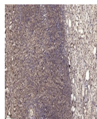
Immunohistochemical analysis of paraffin...