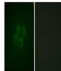
Immunofluorescence analysis of HepG2 cel...