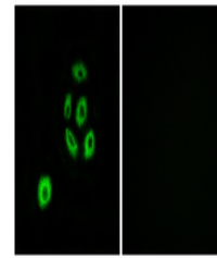
Immunofluorescence analysis of A549 cell...