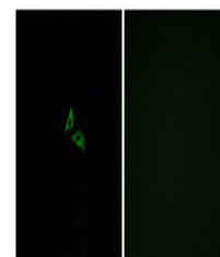
Immunofluorescence analysis of A549 cell...