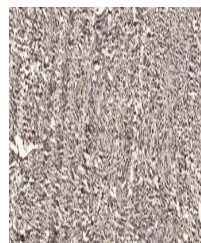
Immunohistochemical analysis of paraffin...