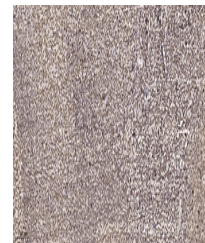
Immunohistochemical analysis of paraffin...