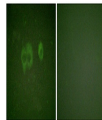
Immunofluorescence analysis of HuvEc cel...