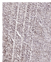
Immunohistochemical analysis of paraffin...