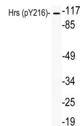
Western blot analysis of lysates from A5...