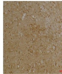
Immunohistochemical analysis of paraffin...