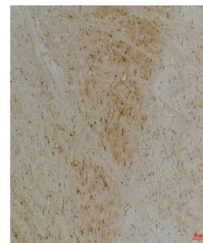
Immunohistochemical analysis of paraffin...