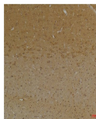
Immunohistochemical analysis of paraffin...