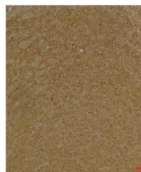
Immunohistochemical analysis of paraffin...