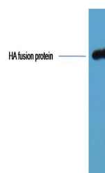
0.5ug HA fusion protein + Primary antibo...