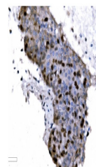
IHC analysis of Ki67 using anti-Ki67 ant...