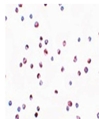
Immunohistochemical analysis of formalin...