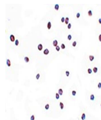
Immunohistochemical analysis of formalin...