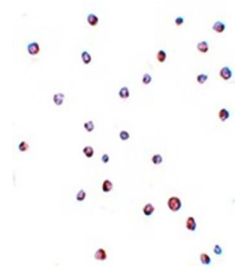
Immunohistochemical analysis of formalin...