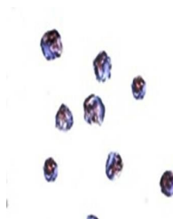
Immunohistochemical analysis of formalin...