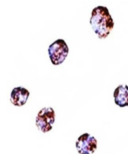
Immunohistochemical analysis of formalin...