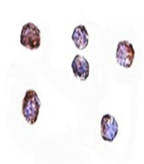
Immunohistochemical analysis of formalin...