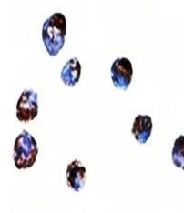
Immunohistochemical analysis of formalin...