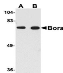
Western blot analysis of mouse brain tis...