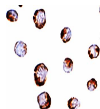
Immunohistochemical analysis of formalin...