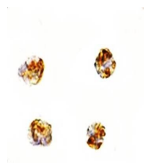
Immunohistochemical analysis of formalin...