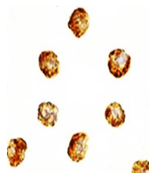
Immunohistochemical analysis of formalin...