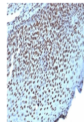
IHC: Formalin-fixed, paraffin-embedded h...