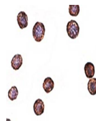
Immunohistochemical analysis of formalin...