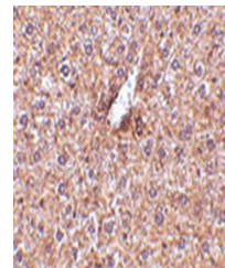
Immunohistochemical analysis of formalin...