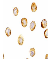
Immunohistochemical analysis of formalin...