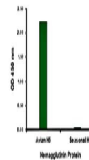
The bar chart illustrates that 1ug/ml Av...