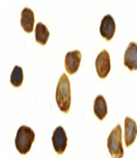
Immunohistochemical analysis of formalin...