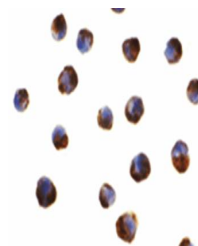
Immunohistochemical analysis of formalin...