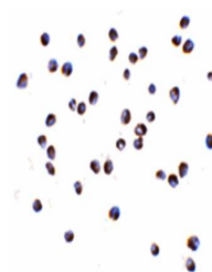
Immunohistochemical analysis of formalin...